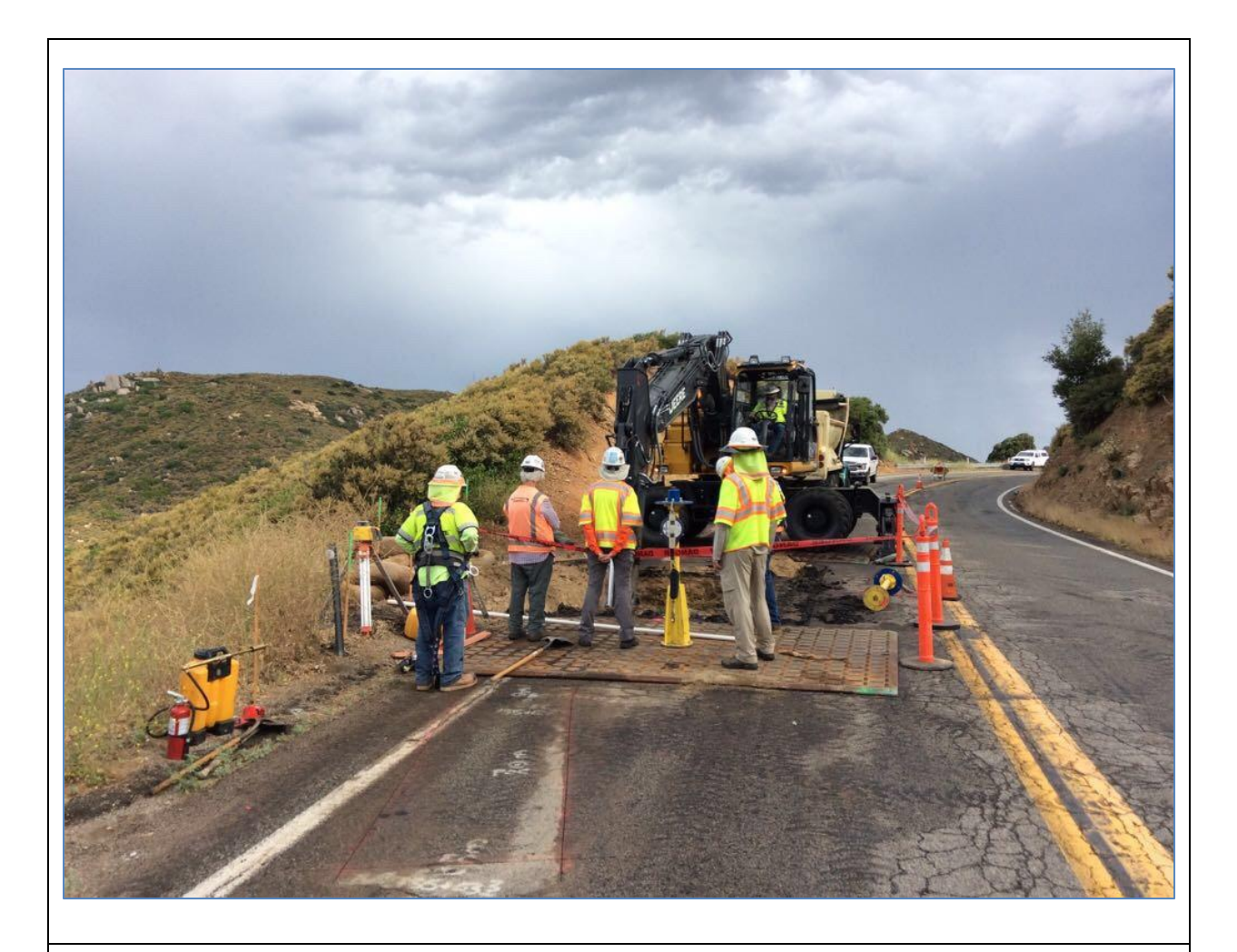
Photo 4: A biological, archaeological, and cultural monitor were present during vault excavation (C 440) in accordance with MM BIO-22, MM CUL-1, and APM CUL-04. A complete set of fire tools were staged on site (5-gallon backpack pump, round point shovel, Pulaski, and 2A10BC fire extinguisher) in accordance with the CFPPP (MM FF-1).