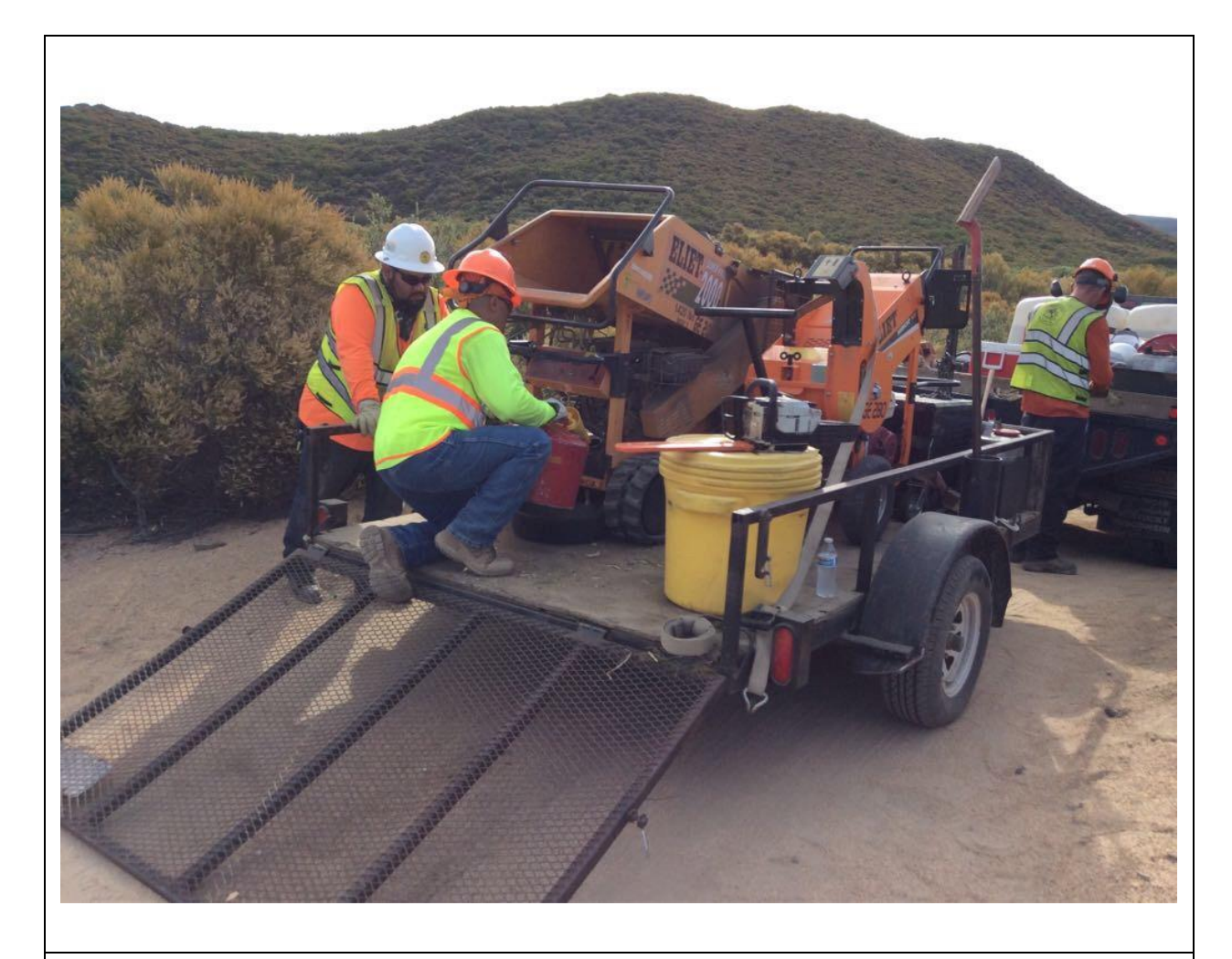
Photo 5: During vegetation removal activities along TL 629A, a drip pan was observed in use during chain saw fueling to prevent the release of hazardous materials onto the ground in accordance with MM PHS-2. The fueling took place first thing in the morning while the chain saw was still cool in accordance with the CFPPP (MM FF-1).