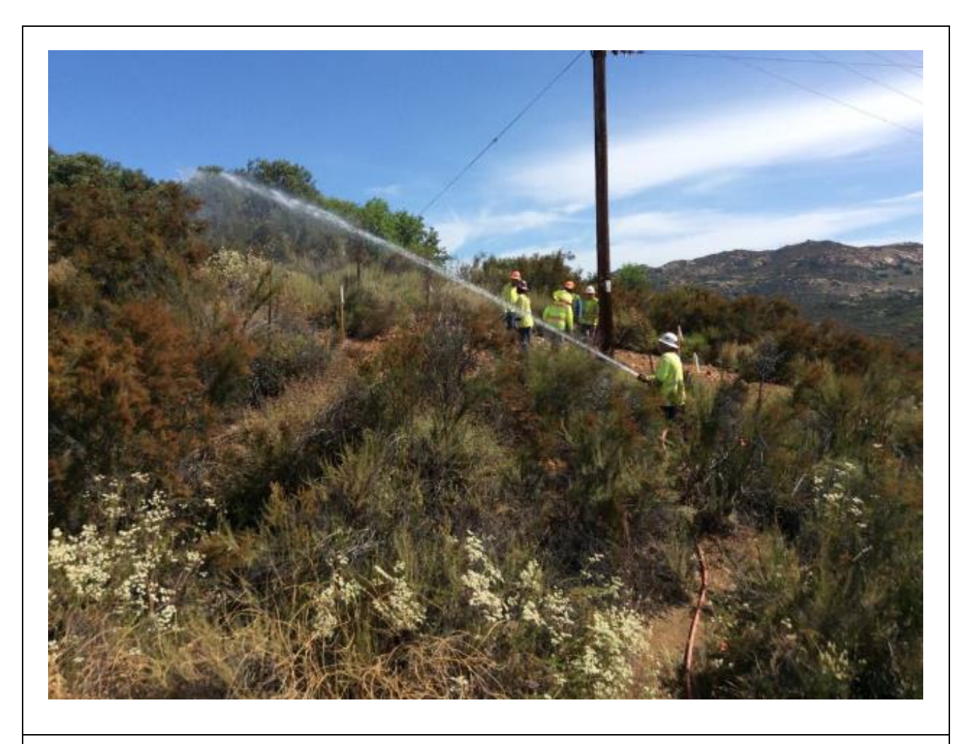
Photo 6: In preparation for vegetation at Pole Z272905 (TL 625C) to be chipped upon removal, the area was wet down prior to the activity in accordance with the CFPPP for the day's fire conditions (Elevated FPI off CNF land). A Fire Patrol was also present with at least 100 gallons of water and a complete set of fire tools on site.