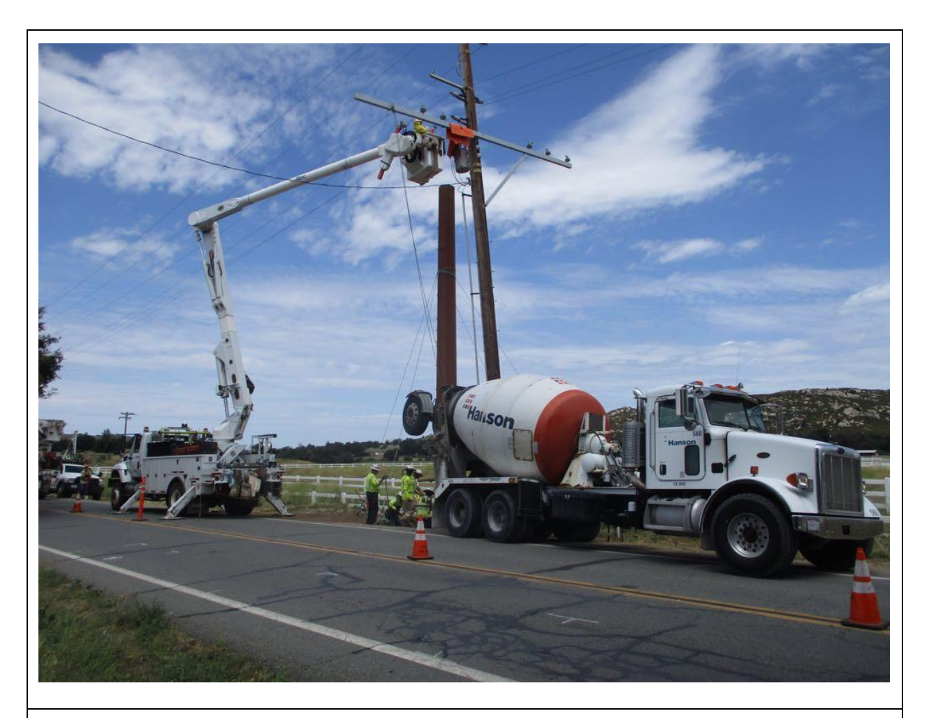
Photo 1: A construction crew was observed removing 12 kV wire protectors used during pole setting, and backfilling around the pole base with concrete on TL 629A. A crew member was conducting traffic control along Viejas Boulevard during the activities in accordance with the TCP (APM TRANS-05).