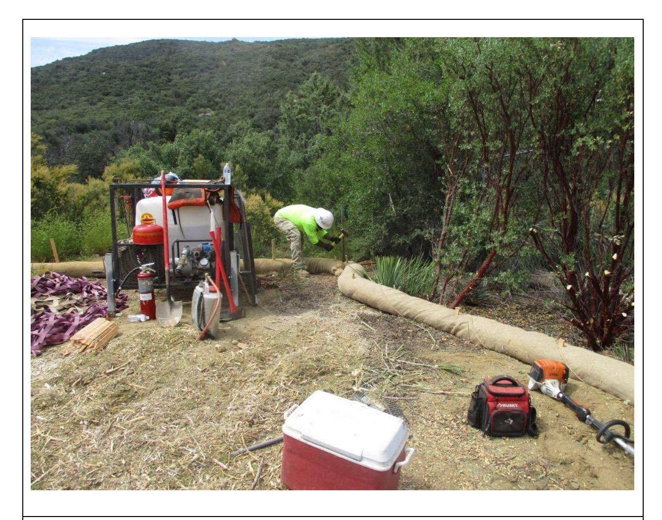
Photo 2: A construction worker observed installing perimeter fiber rolls at Pole Z173110 (TL 629A) for erosion control in accordance with the ECP and SWPPP (MM HYD-01, MM BIO-7).